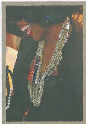
Sparkle and shine for less at Meeps Vintage Fashionette.