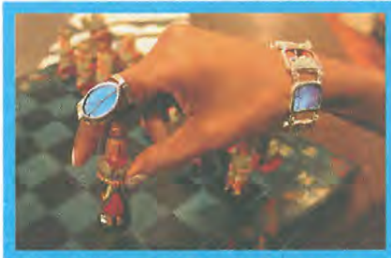
Peruvian butterfly sightings at Toro Mata.