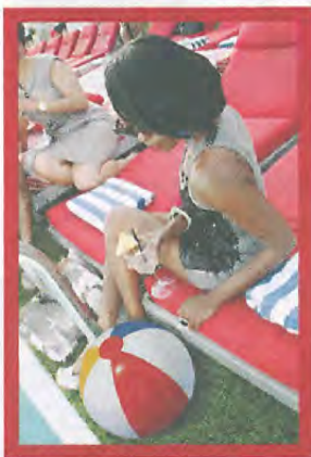
Poolside is the best revenge at Vida Fitness.